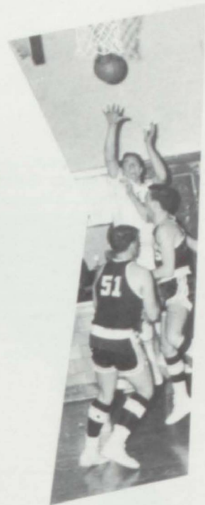
"What happens if I catch it?"