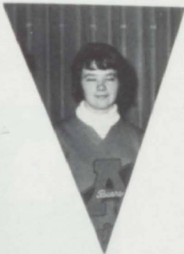
"Who . . . needs . . . Sleep . . . e . . . z . . . e . . . ?"