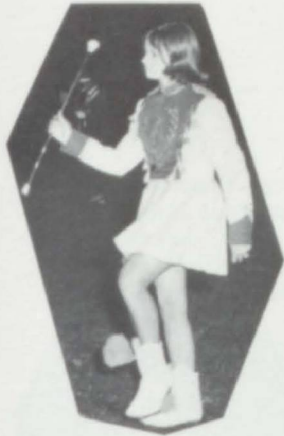
"I think this is right!"