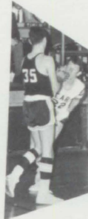
"I told you once, now . . ."