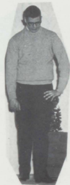
"Moments of Meditation"