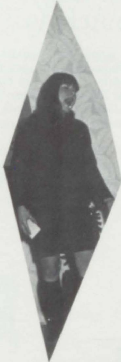
"I'd rather do it myself!!"